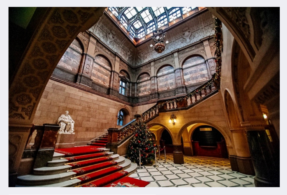
The staircase at Sheffield Town Hall