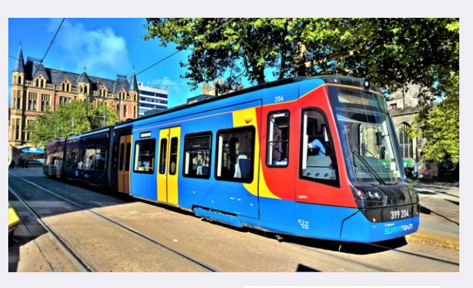
A Sheffield Supertram