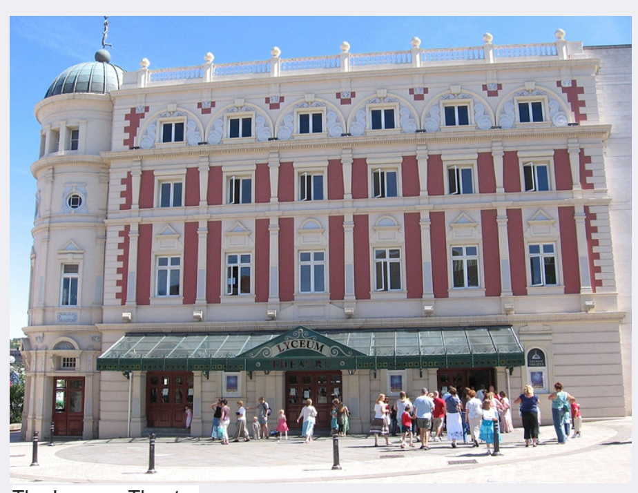
The Lyceum Theatre