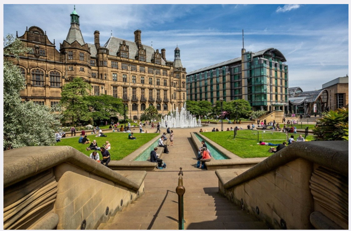
Leopold Sheffield Hotel