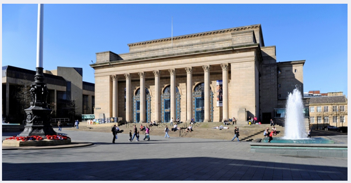
Sheffield City Hall