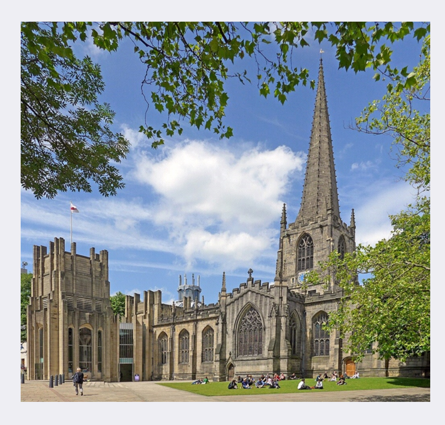
Sheffield Cathedral, one of the oldest churches in the city and the mother church of the Diocese of Sheffield.