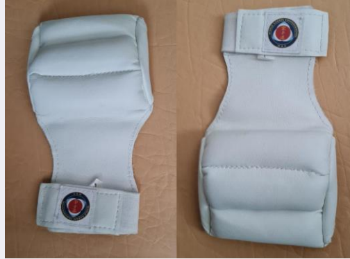
WHITE WKC MITTS