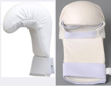
WHITE STANARD MITTS