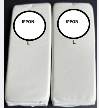
OTHER STYLE IPPON MITTS