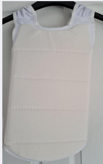
TYPICAL FEMALE CHEST PROTECTOR FOR GIRLS 10 YEARS & ABOVE WORN UNDER THE KARATE GI.

TAEKWONDO STYLE BODY ARMOUR AND HEAD GUARDS ARE NOT ALLOWED IN WKC KUMITE