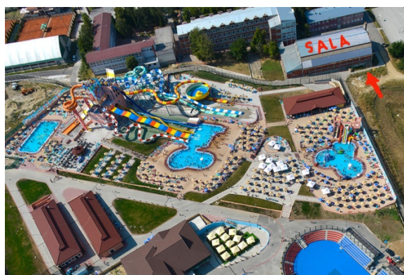
Sport Hall and aqua park