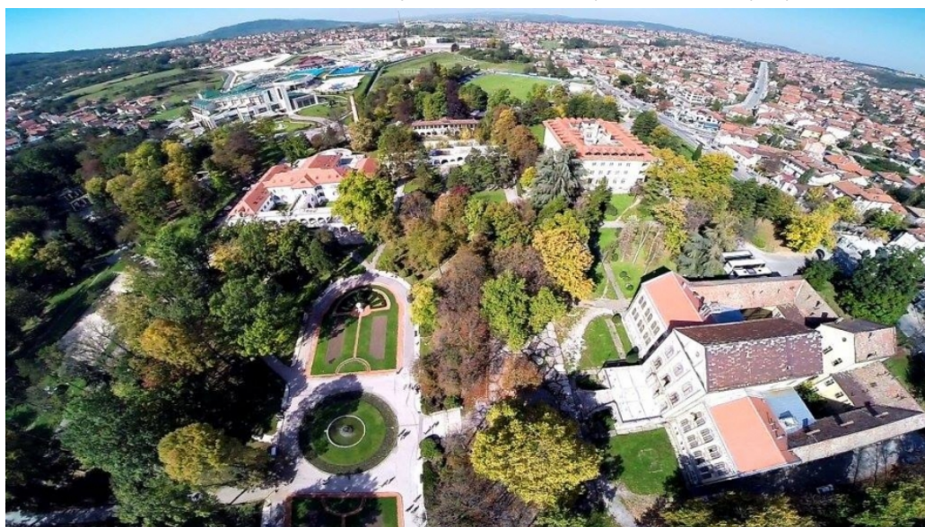
Panorama of Arandjelovac