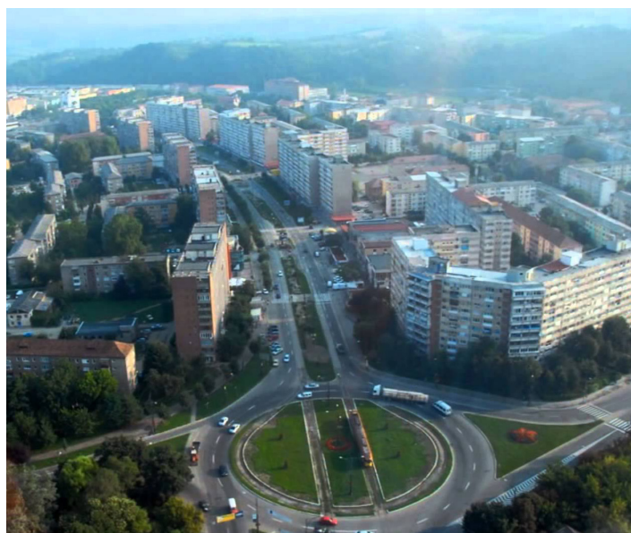
Panorama of the town Resita