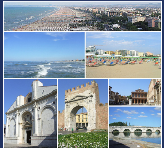
Rimini, the venue of the the 11th WKC World Championships for Cadets, Juniors and Seniors and World Cup for Children