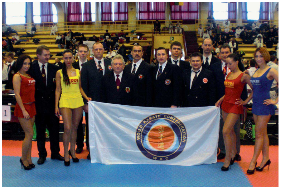
Referees and officials