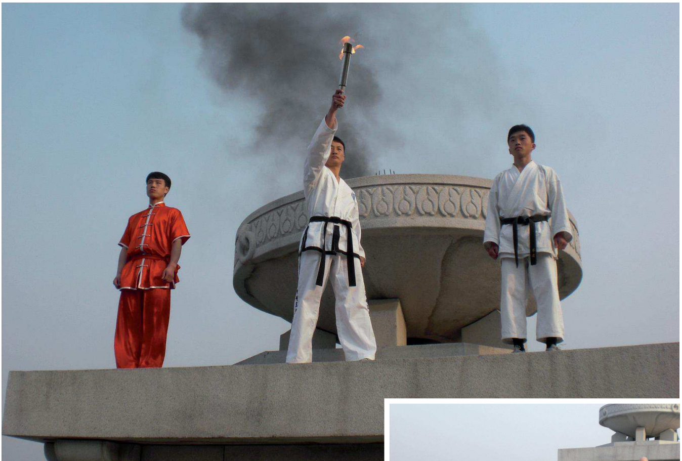
The torch is lit