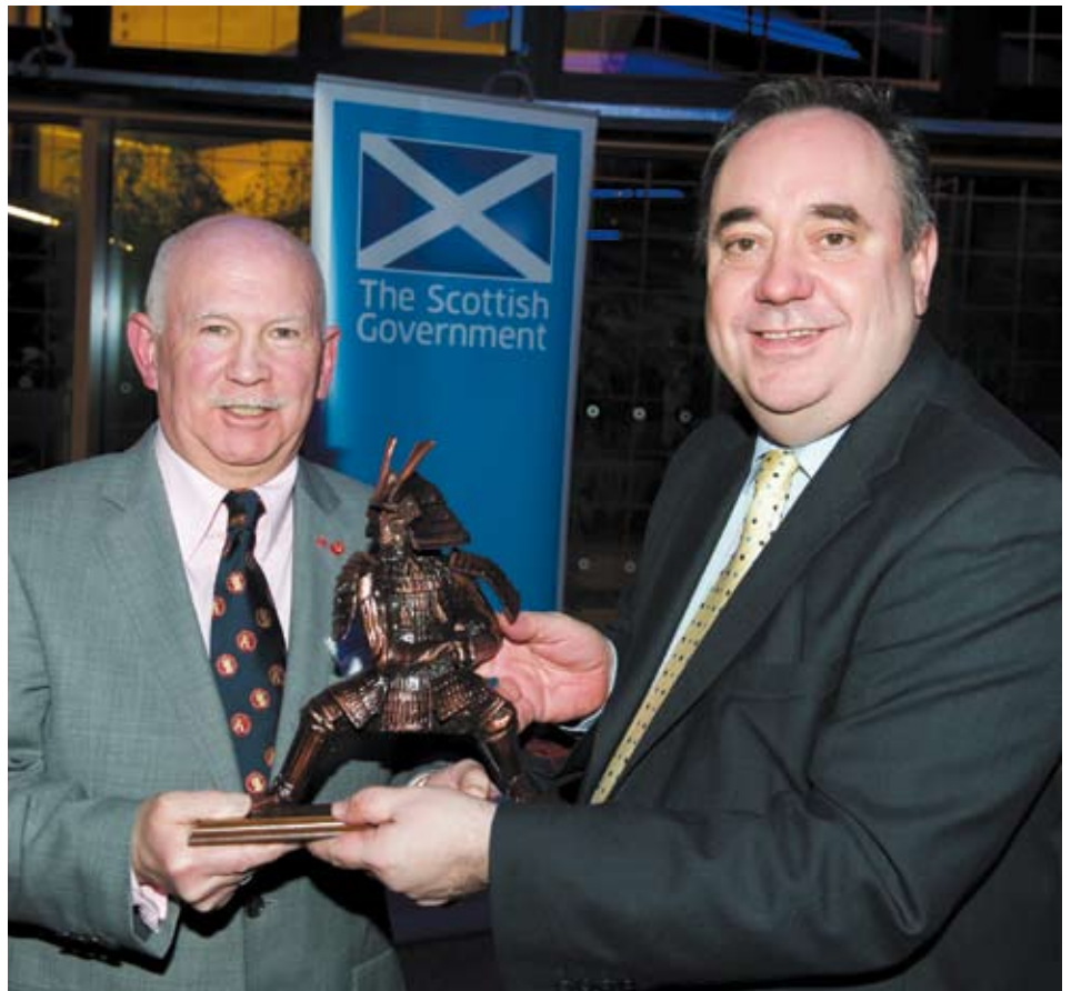
Samurai award for First Minister A. Salmond