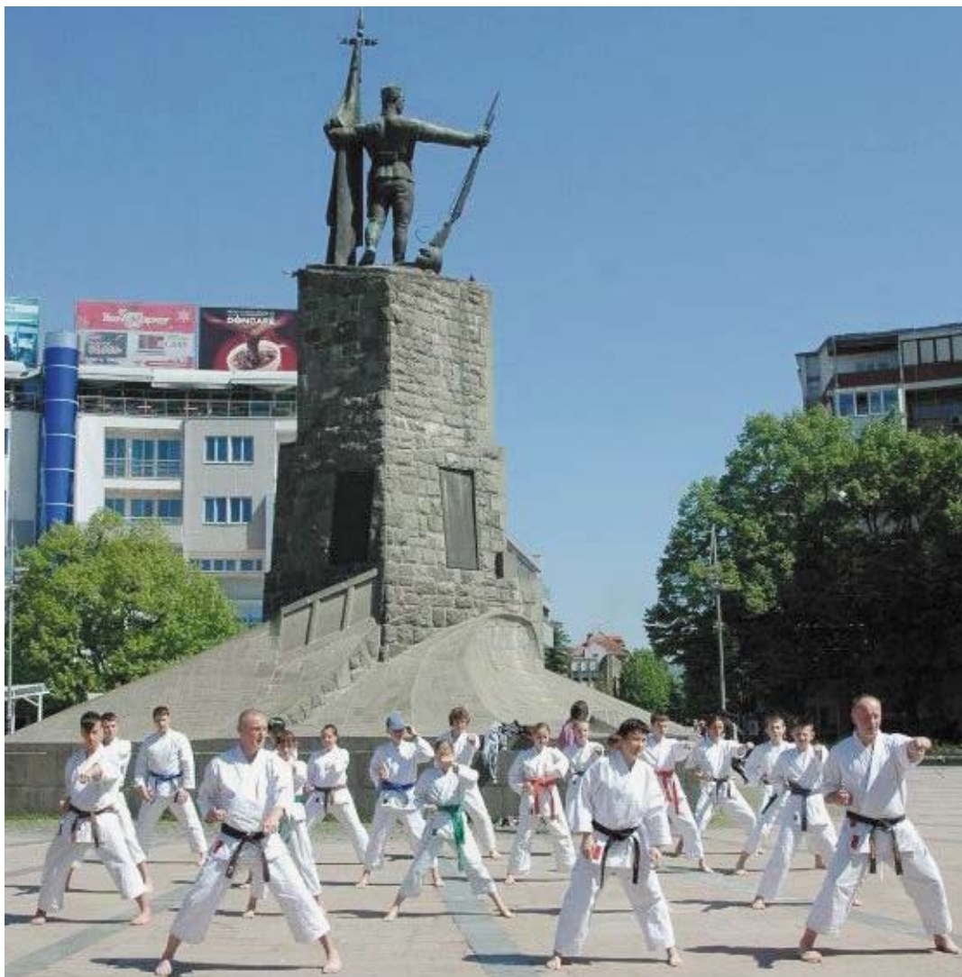
Karate Exhibition in Kraljevo

The software connects all tatamis with one central database. For that reason it is possible for many workstations to work on the same drawing tables at the same time. This design also ensures the availability of data for all our clients at any time. It is easy for the administration to overview and to trace all activities on the tatamis during the event. Because of the fully automated generation of the draw tables, recharge tables and result lists, you will no longer have to worry about time-consuming manual activities to create these outputs.