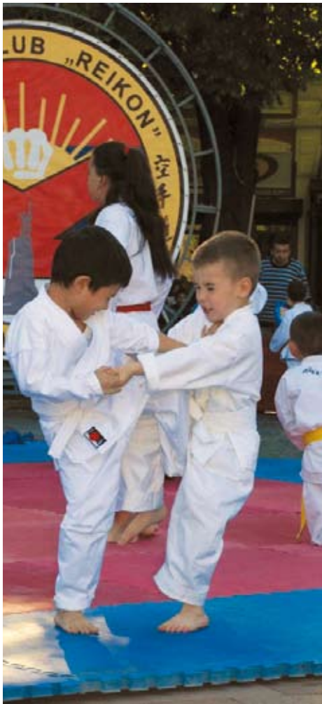
Future Champions in Kraljevo