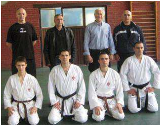
Leadership and top athletes Karate Club Novi Beograd