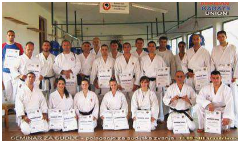
New licensed SKU referees