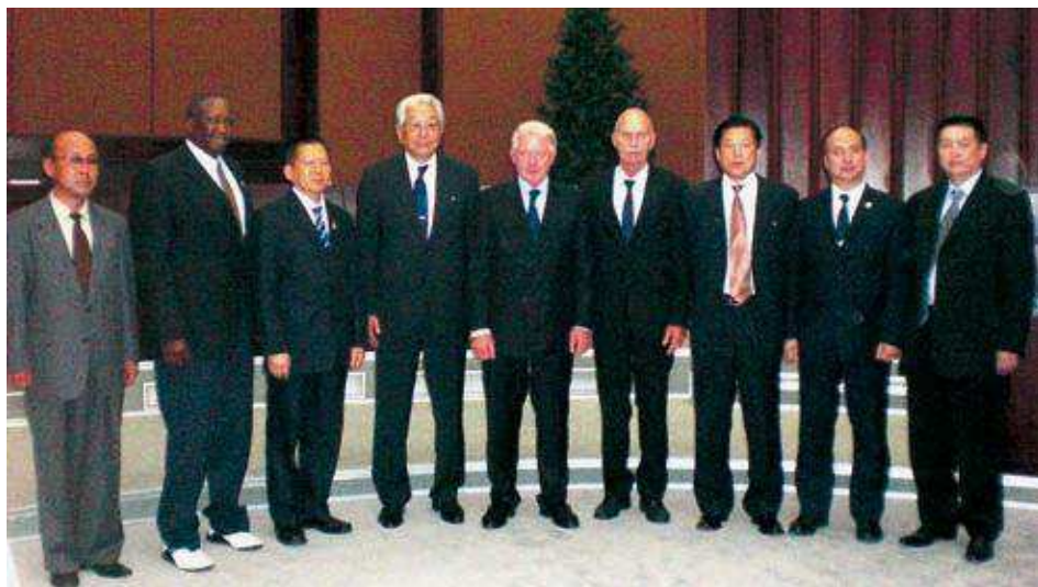
SportAccord President H. Verbruggen (center) with the IMGC EB