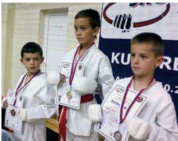
Young Champions at a recent SKU tournament

The AAU Karate is going to organise an international open WKC tournament. All karateka are encouraged to take part in this event, especially those from Pan-America.