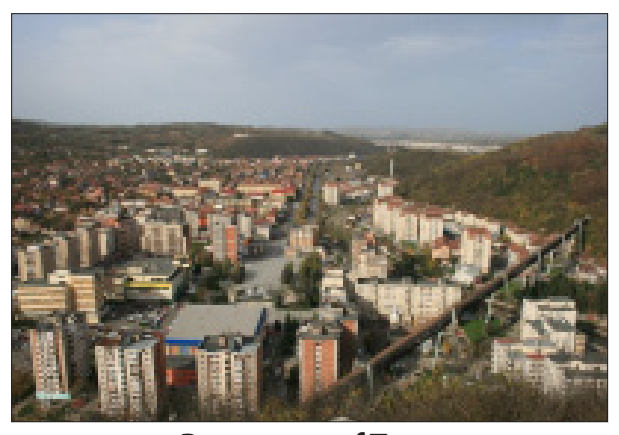
Panorama of Town