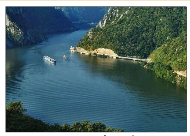
Panorama of Danube