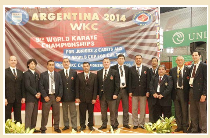
WKC referees at Buenos Aires