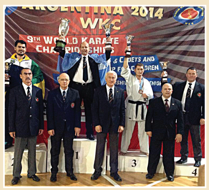
WKC officials with representatives of the hosting federation